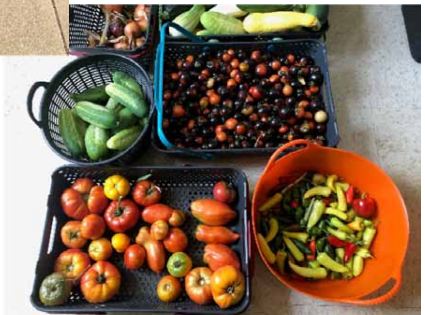
Closeup of SHF Harvested Vegetables

This will allow an expansion of the year-round growing season. Winter 2020 will be the initiation of the hydroponics initiative. The plan is to continue the weekly farmers market in Middletown and to add a produce retail store at SHF as well. Stay tuned for more details about this new operation.