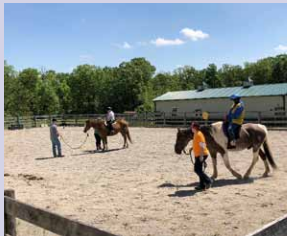
Side Walkers facilitating therapeutic riding at SHF