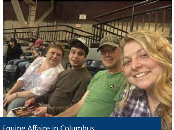
No horsing around needed to generate smiles at the Equine Affaire in Columbus