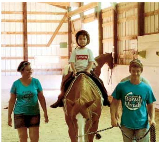
Therapeutic Riding benefits riders of all ages at SHF

We are very grateful to The Spaulding Foundation for the grant of $20,000 toward the expansion of our therapeutic riding program.