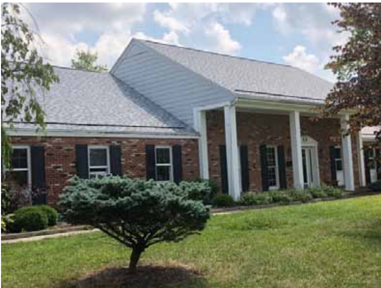
Anonymous Donor with Hamilton Community Foundation Provides a new roof & gutters for Welcome House

After 10 years of wear-and-tear, the carpets in the living rooms and staff rooms of our four residences needed replacing. We replaced them with vinyl plank flooring this spring which will make for longer life and much easier cleanup for the staff. Your continued donations and participation in our fundraisers are what makes these kinds of important property projects possible. Thanks to everyone for your support.