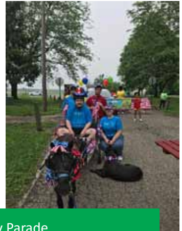
Therapeutic Riding Program highlighted at the Middletown Memorial Day Parade