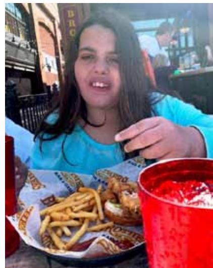
Everybody needs a pumpkin OR a Hole in One at Putt Putt OR a yummy luncheon out!