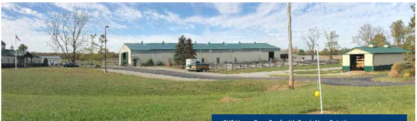
SHF Horse Barn Roof with Fresh New Paint!