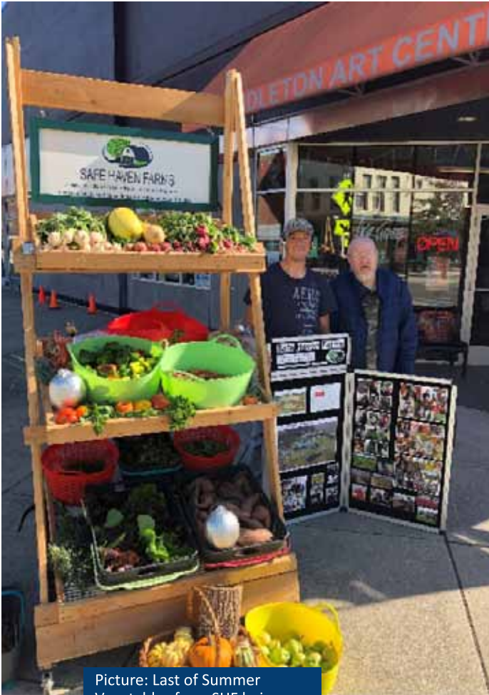
Picture: Last of Summer Vegetables from SHF being sold in Middletown

Fall is a busy time on the farm. The last of summer harvest and the weekly Middletown Farmers Market are finished.