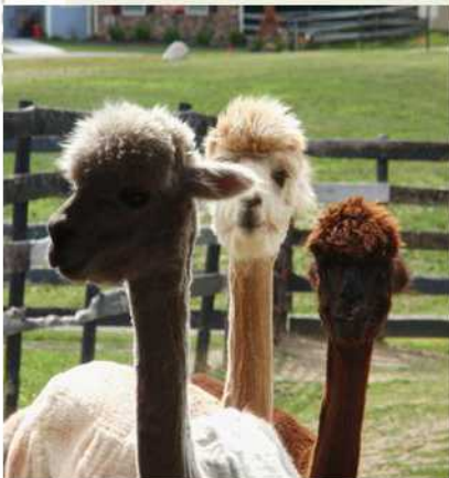
The resident alpacas (above) hope to be joined by horses in the not too distant future!

Start up costs include a barn renovation, an indoor arena with seating area, new fencing and gates, as well as an outdoor arena. It is our desire to open this program to children and adults with autism who live in the surrounding communities! If you know of anyone who would be willing to donate financially to make this program happen, please contact us at Donations@SafeHavenFarms.org .